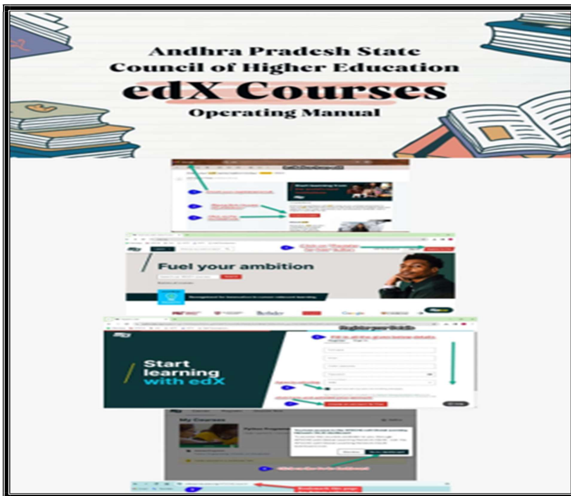
STUDENTS REGISTRATION FOR EDX COURSE

The II and IV Semester Students of our college got registered in Edx Courses prescribed by Andhra Pradesh State Council of Higher Education and Sri Venkateshwara University, Tirupathi.