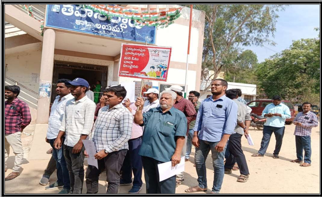
VOTERS' AWARENESS RALLY, VALMIKIPURAM

Our college students along with the staff participated in voters awareness rally conducted by our college in association with Mandal Tahsildar's office, Valmikipuram on 06.04.2024. in View of ensuing General Elections May,2024.